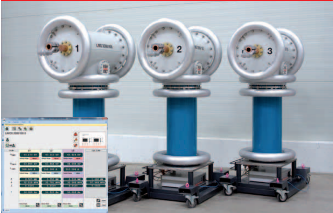
Fig. 1 LiMOS 2000/100 consisting of three sensors with Measuring and Transmitting Units (MTU) and the remote screen