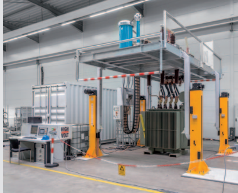
Fig. 2 Example showing the practical implementation of a customer-specific automatic switching system with height adjustment