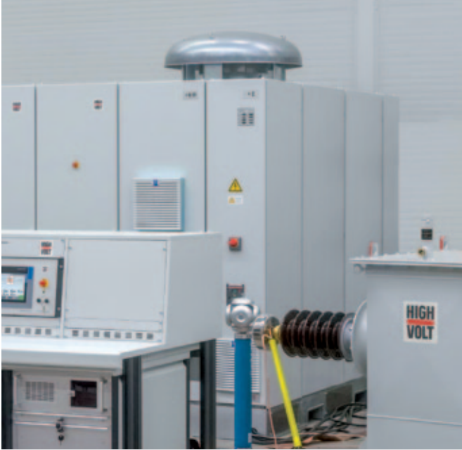
Fig. 1 Fully automated control system and frequency converter