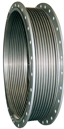
DN 600 - DN 2800