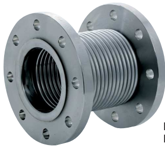
DN 15 - DN 500